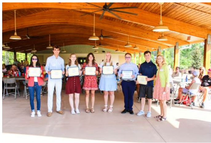
Kiwanis Award Winners